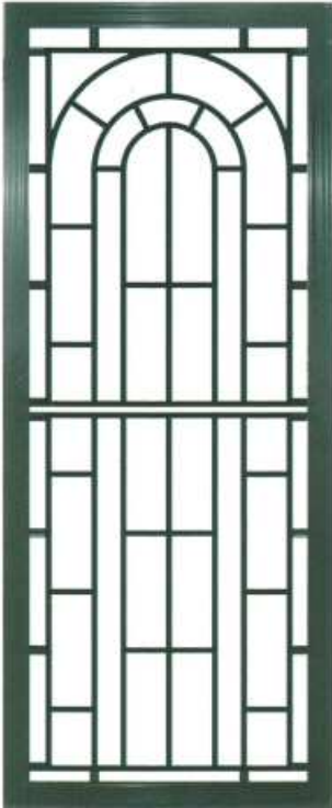
SA2 AND SA1

FOR HINGED DOORS (Please note - the first part number represents the top grille, the second represents the bottom grille)