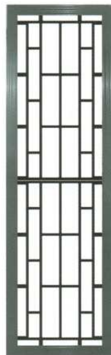
SA12 AND SA12