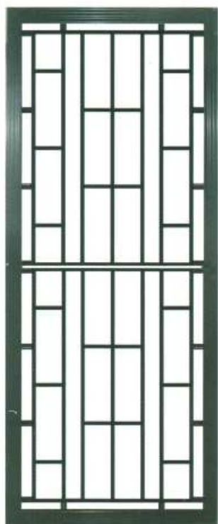
SA1 AND SA1