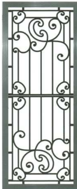
SA9 AND SA9