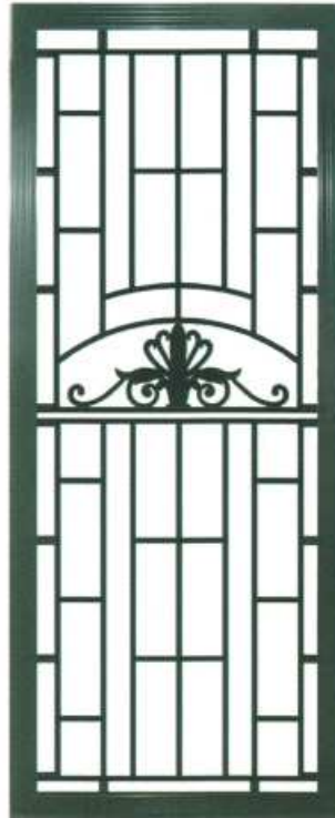
SA3 AND SA1