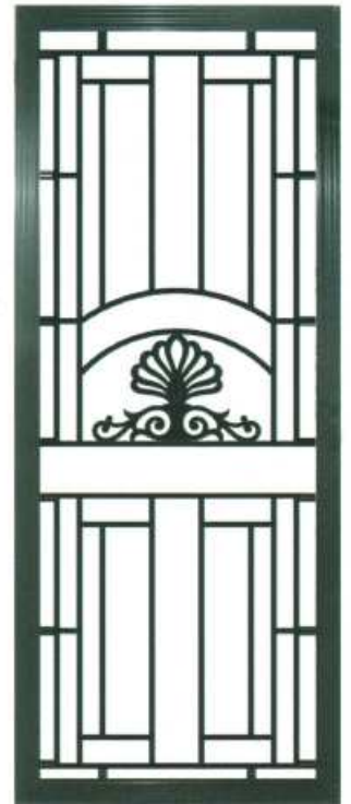
SA4 AND SA5