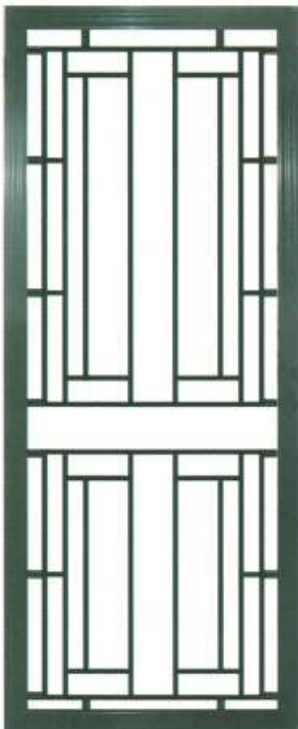
SA8 AND SA5