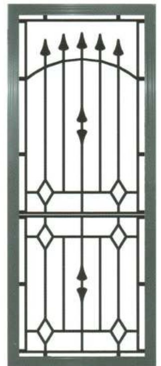
SA10 AND SA11