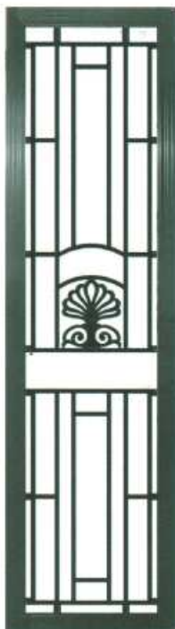
SA6 AND SA7